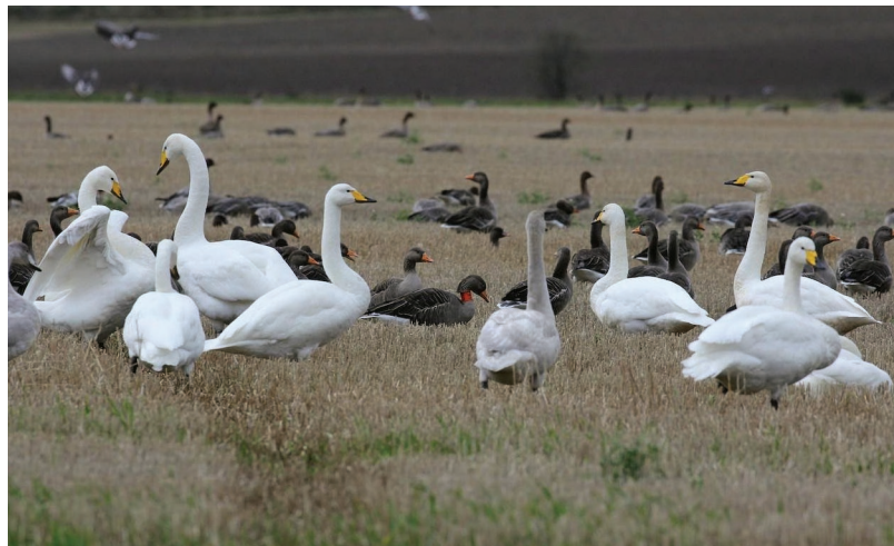
Whooper Swans and Greylag Geese at Whitehouse, Alford, with several Pink-feet in the background. The goose in the middle of the photograph with the red neck ring was ringed in Iceland 2017.

Pink-feet are very similar in appearance though a bit smaller. The noticeable identifying differences are a smaller black beak with a pink band and somewhat darker head and neck. They arrive in Scotland in late September and can be seen in very large flocks, numbering often in the thousands, feeding on local stubble fields. They can be very mobile, moving noisily