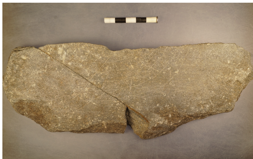
The Pittodrie 'sun-stone' (5cms scale).